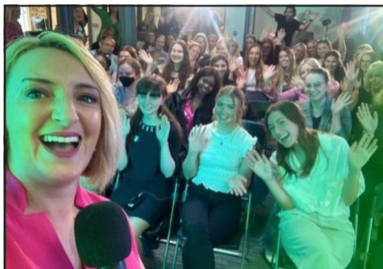
Colleagues from our First Derivative business unit at a recent IMPACT event in the newly refurbished Canal Quay offices. Left -