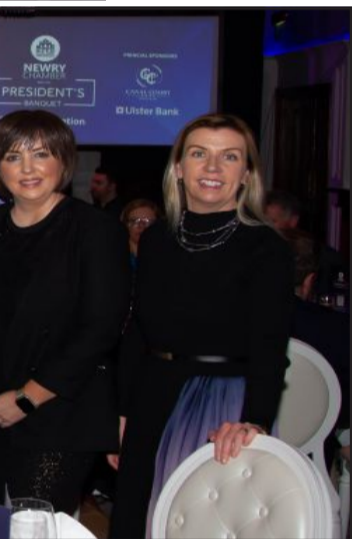
Friday . NM224443