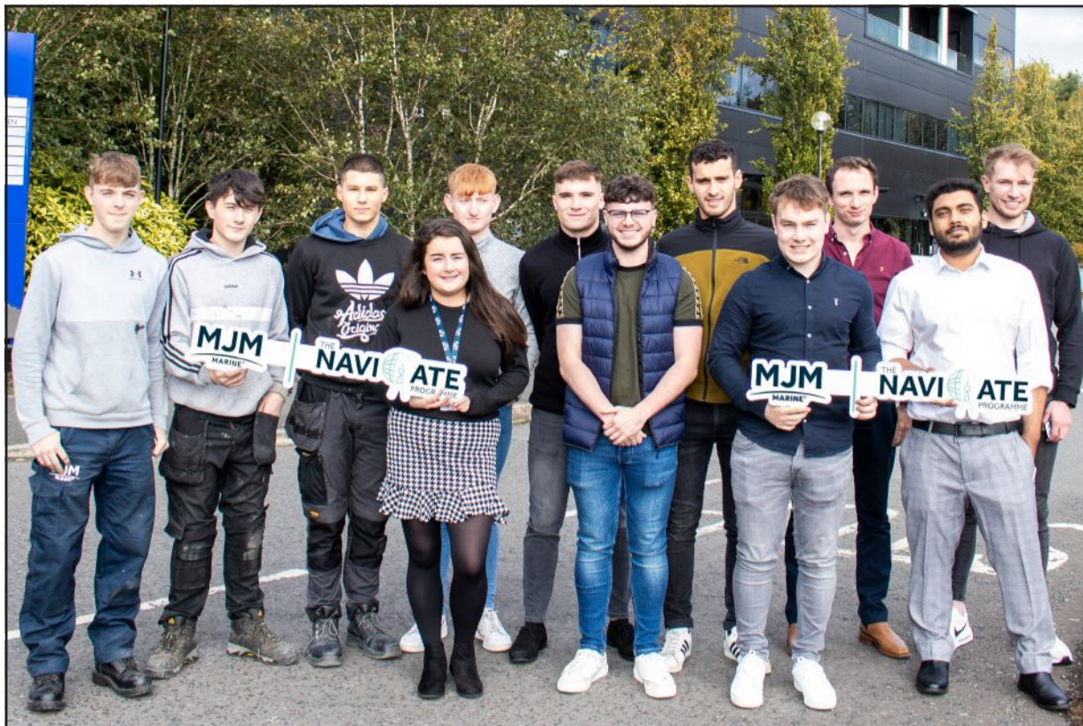
Some of the new intake of Students, Graduates and Apprentices working across Design, Quantity Surveying, Production, Contracts and Estimating.