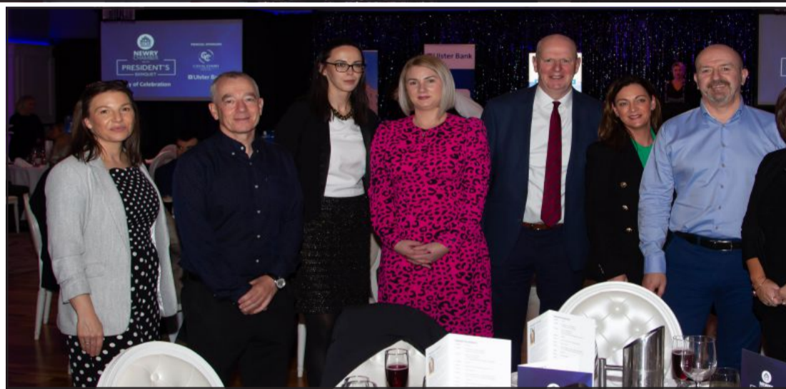
STAFF from the SRC enjoying the Newry Chambers Presidents Banquet in the Canal Court Hotel on Friday.