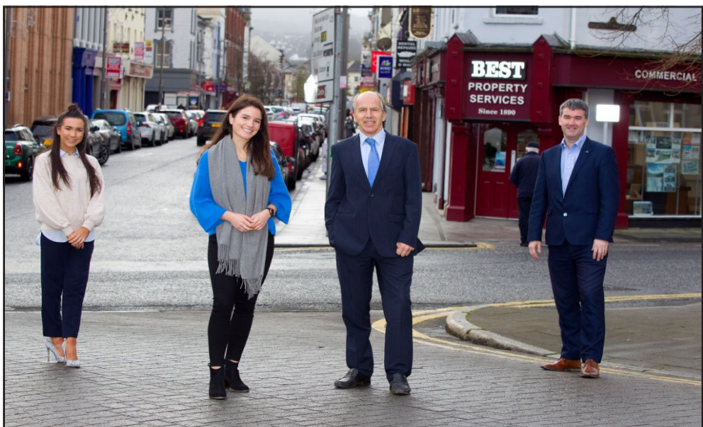
Members of Best Property Services.

Contact any of our offices to arrange a FREE valuation of your home.